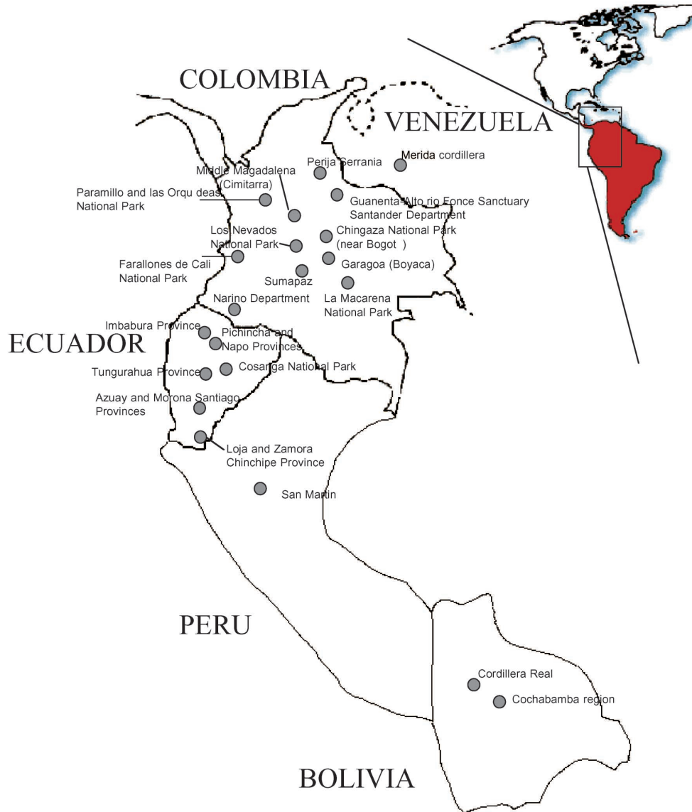
Fig. 1. Map showing the five Andean countries where the spectacled bear is distributed and the collection sites where samples were obtained.

mid gels in a Hoefer SQ3 sequencer and were stained with silver nitrate. This method provides resolution of one nucleotide base difference.